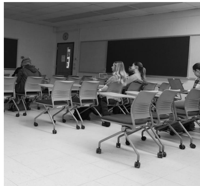
Low attendance stretches to many classrooms after the announcement of class cancellations.

According to the chancellor's March 11 email all face-to-face classes are suspended until April 10, at which point the campus community will receive updates from the administration on whether the classes will continue either online or in person.