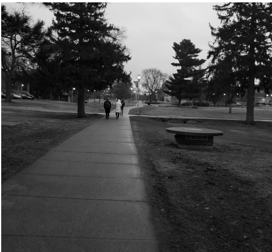
Empty side walks the morning of March 13, as many students head for home.