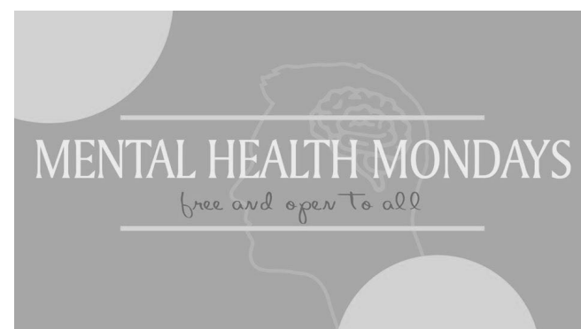
Promotional image from Diversity Inclusion and Belonging social media.

about mental health. It is something that we value and want to give students the opportunity to continue to be able to work on and develop skills that will help them beyond college and be successful adults.”