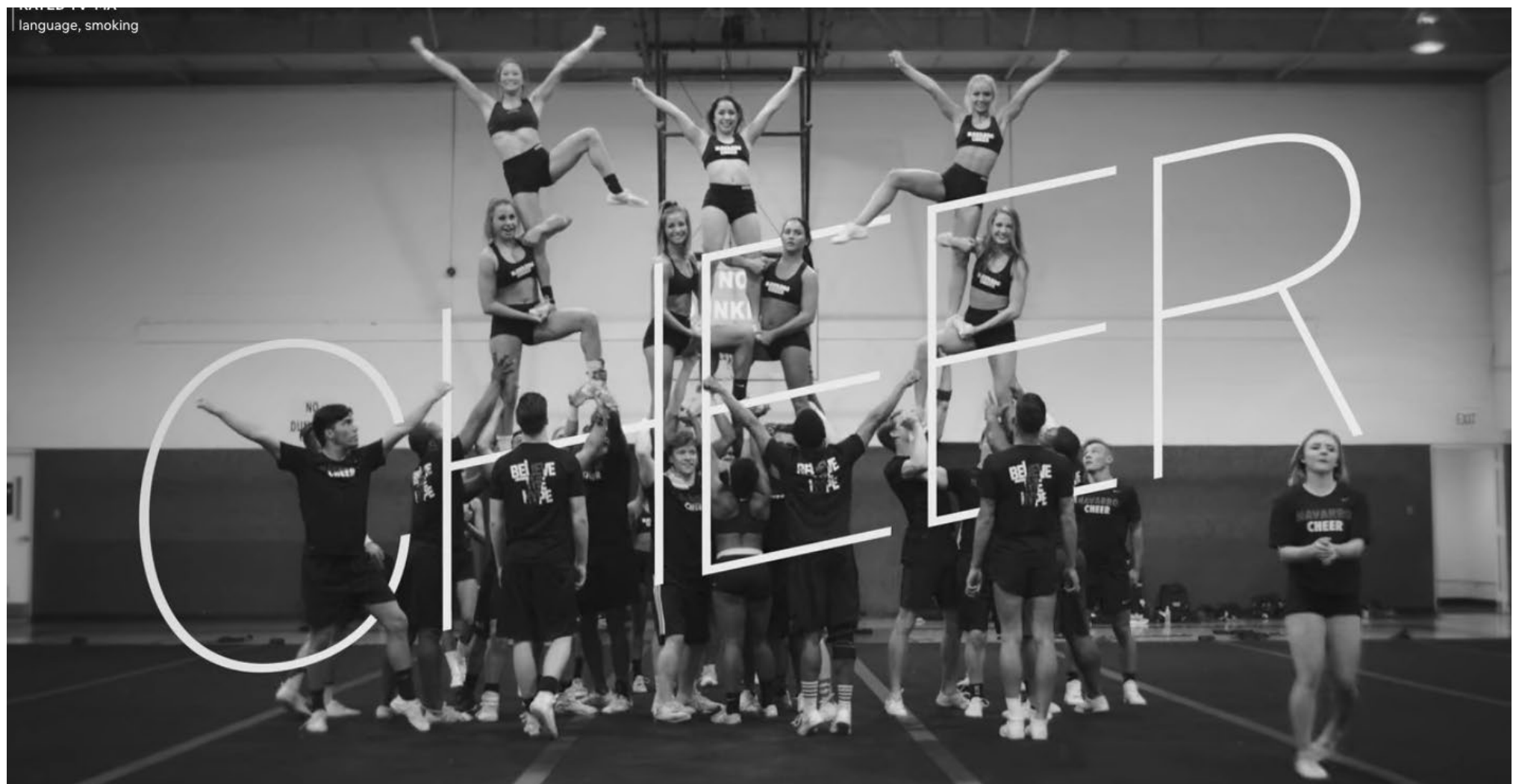
Screenshot of Netflix documentary “CHEER”

Overall, I think this was a great show to watch. I was very skeptical of this show at first because of the stereotype that cheerleaders have, but this show definitely diminishes that. Cheerleaders are normal people just like us.