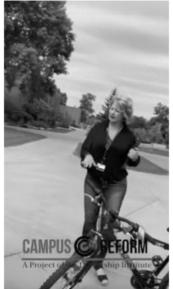
Screenshot of Campus Reform video of occurrence on UWRF campus

At the end of the day UWRF is public property and these policies may be seen as infringing on student's free speech. However, student's safety is a priority of the university and the policies can also be seen as ensuring safety on a day to day basis. It seems there is a need for a policy, but the current policy could use some updating.