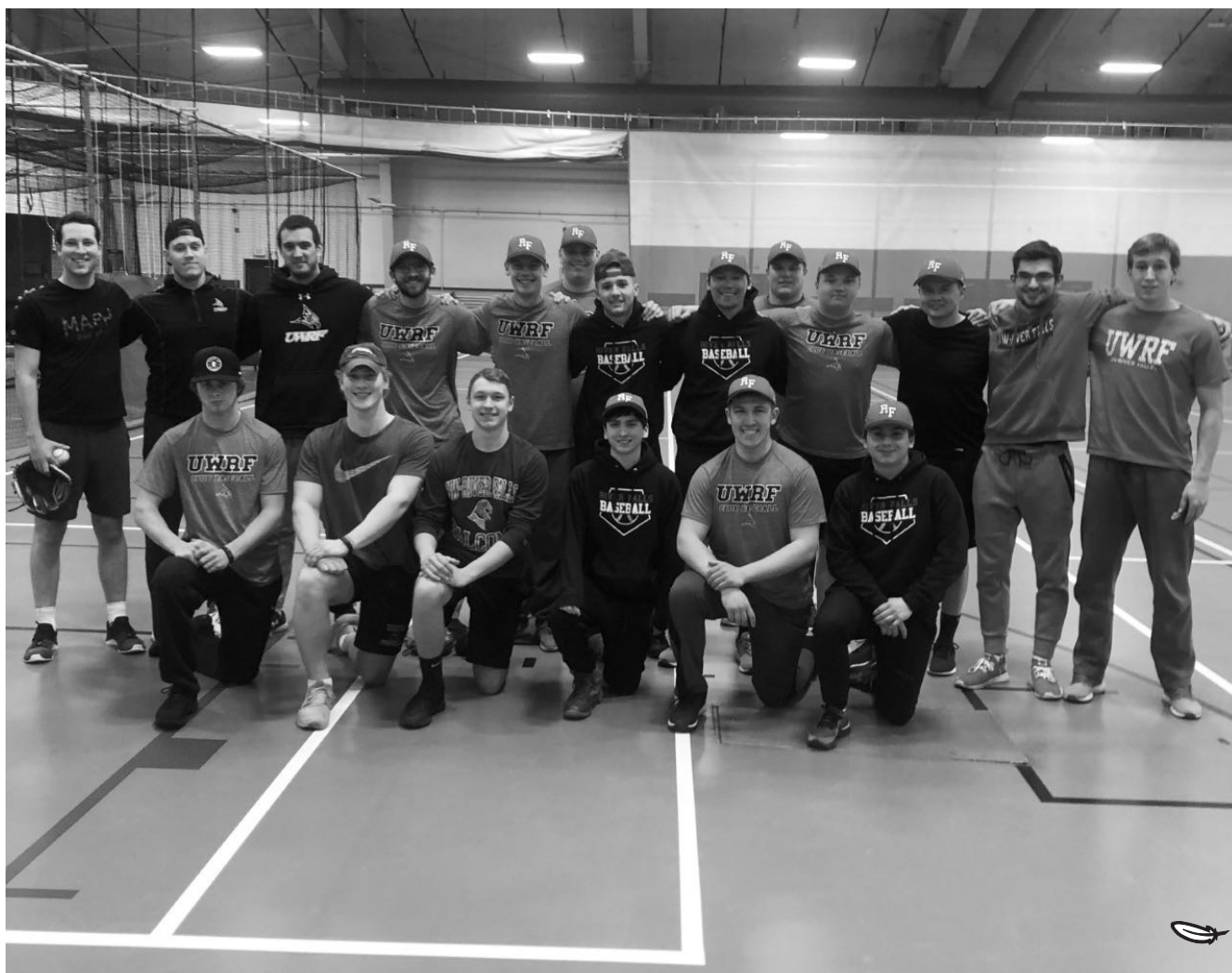
The 2019-2020 UW-River Falls men’s club baseball team.