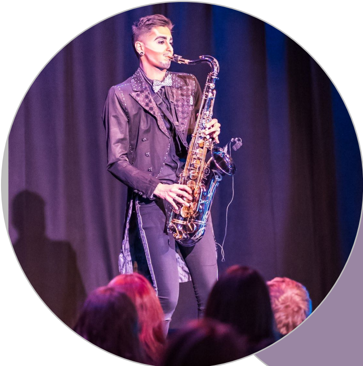
Photos taken from UWRF drag show on March 7. Story on page 7.