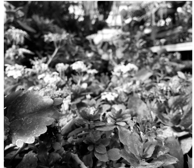
Plants from UWRF greenhouse

An exciting addition to the greenhouse is the infamous corpse plant. A past gift to the greenhouse, the corpse plant is an enormous standing plant that has two leaves that look like trunks of small